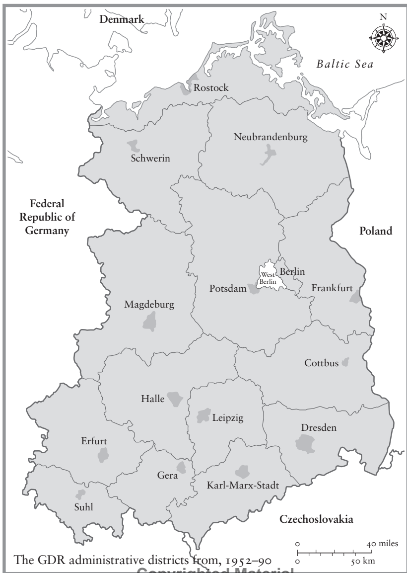
The GDR administrative districts from, 1952-90